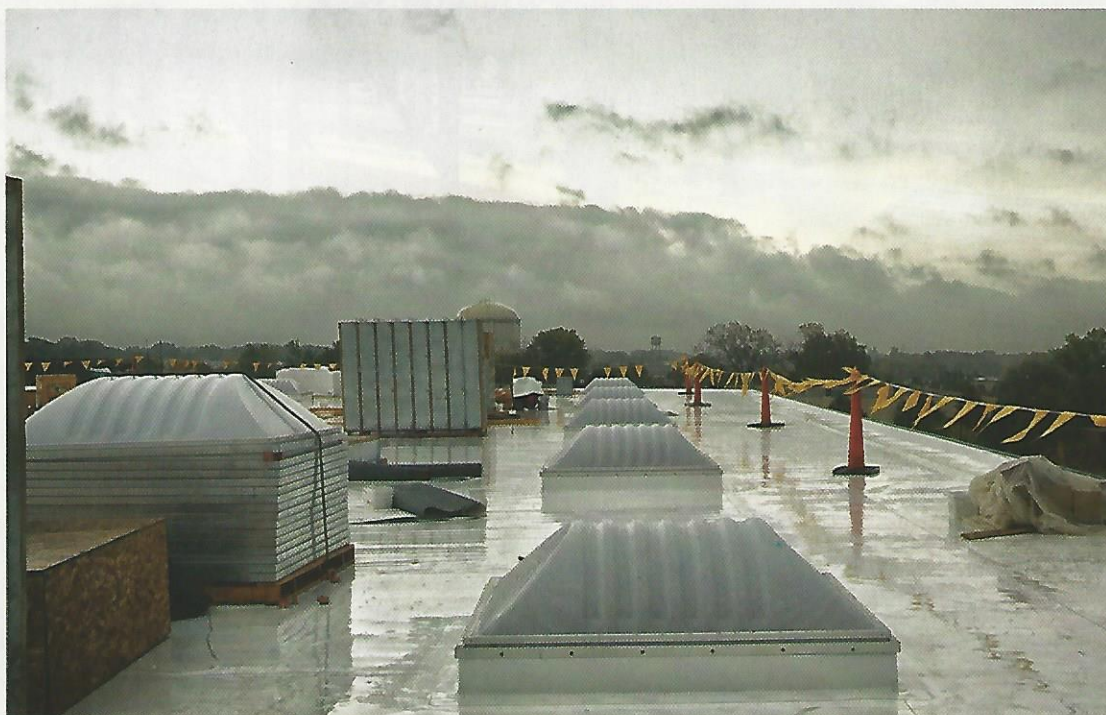
Prismatic lenses for skylights disperse natural sunlight into a facility more effectively. Combined with photocell sensors on high-efficiency lights, these “daylighting” technologies can cut lighting costs dramatically.

ding system suppliers to model energy needs and identify high-efficiency drives and motors.